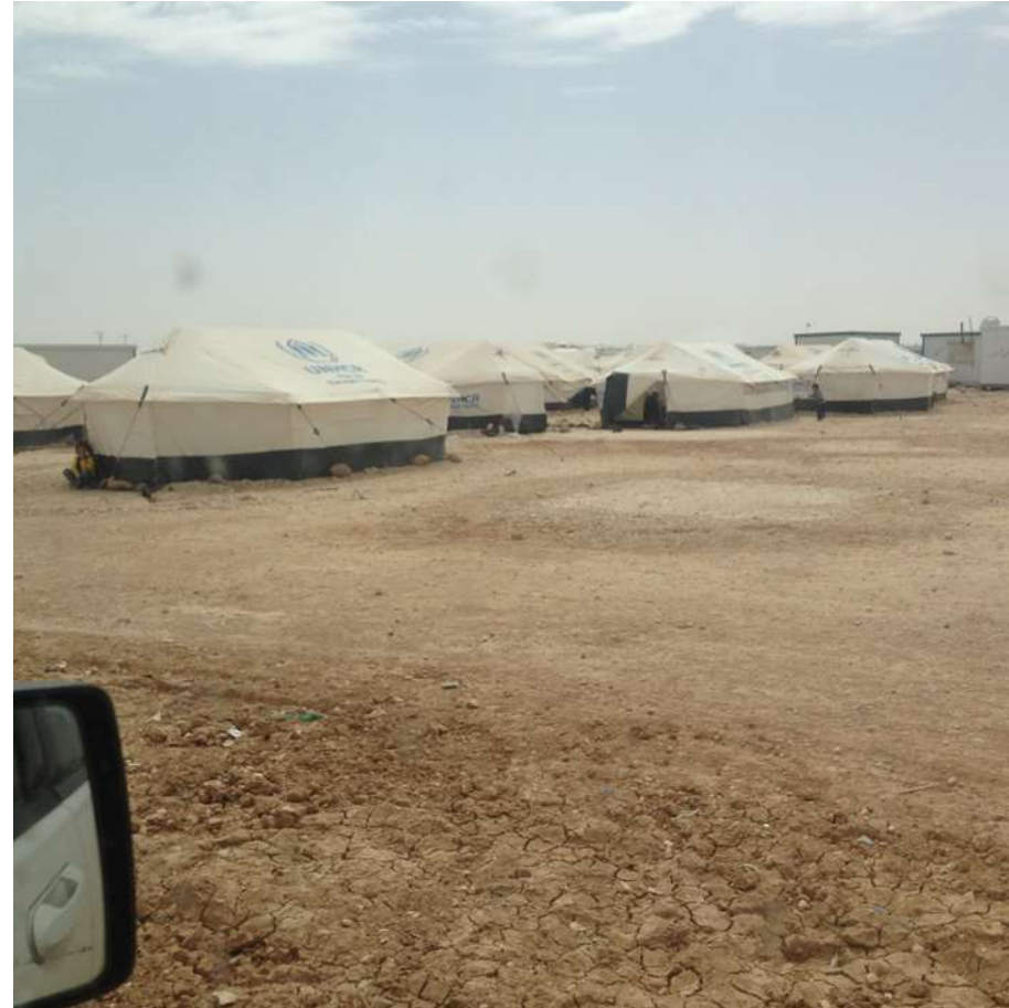
Zaatari Camp for Syrian Refugees 2014