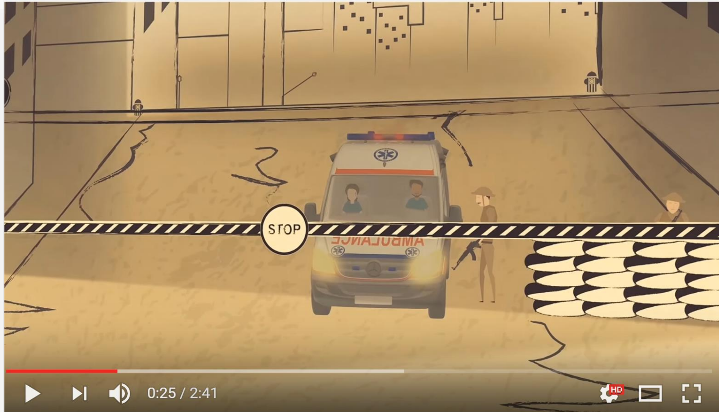
Protecting health care together

HEALTH CARE MATTER IT'S A MATTER OF LIFE IN DANGER & DEATH