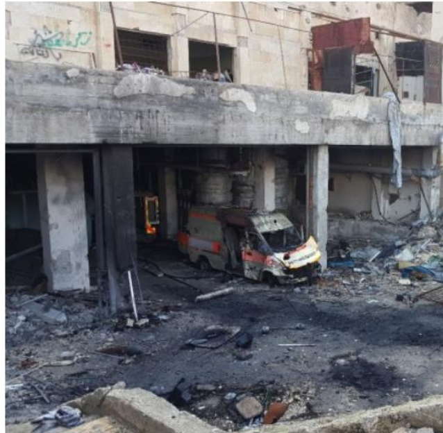
Aleppo, national hospital