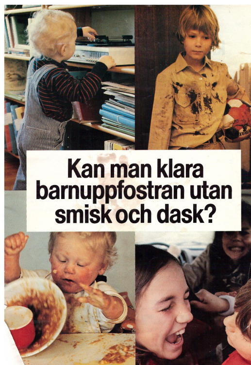
Figure 1 Publicity leaflet Swedish: Can you bring up children successfully without smacking or spanking?

Sweden is the only country that has been able to follow the effect of the ban with repeated studies using the same methodology over a 40-year period. Nationally representative samples of parents have been asked about knowledge, attitudes to spanking and behaviour according to Conflict Tactic Scale, an internationally well renowned methodology developed by Murray Straus 6 in 1971. Two years after the ban, >90% of Swedish adults were aware of the law. While 90% of parents in Sweden spanked their children in the 1970s, <10% did so in 2000, and even less in the last survey in 2016. For the majority of young Swedish parents, spanking is not an option and is looked on as adverse behaviour. 7 There are probably